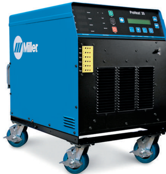
ProHeat 35 power source shown with optional running gear (195436).

Designed with flexibility and efficiency in mind, the air-cooled cables can be wrapped into coils of various shapes and sizes to fit almost any induction preheating application, without the need for cooler and coolant. For temperatures up to 392 degrees Fahrenheit (200°C).