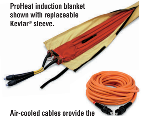
Air-cooled cables provide the same flexibility as liquid-cooled cables for preheating.

Improved working environment is created during welding. Welders are not exposed to open flame, explosive gases and hot elements associated with fuel gas heating and resistance heating.